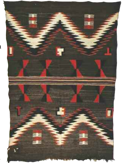
19th-century Navajo blanket

Tues., July 23, 6:45–8:45 p.m.; Ripley Center; CODE 1HO-863; $30–$42